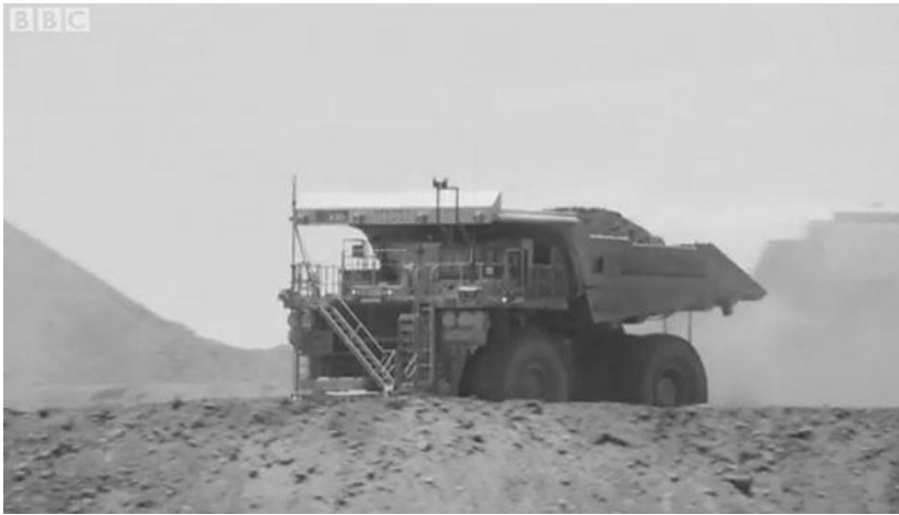
Image from an original BBC Click programme. Click is a BBC television programme covering news and recent developments in the world of consumer technology.