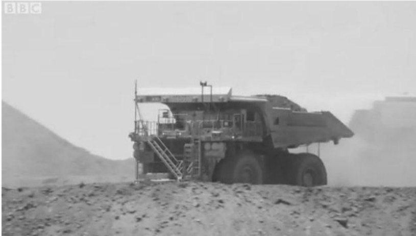
Image from an original BBC Click programme. Click is a BBC television programme covering news and recent developments in the world of consumer technology.