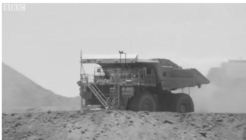
Image from an original BBC Click programme. Click is a BBC television programme covering news and recent developments in the world of consumer technology.