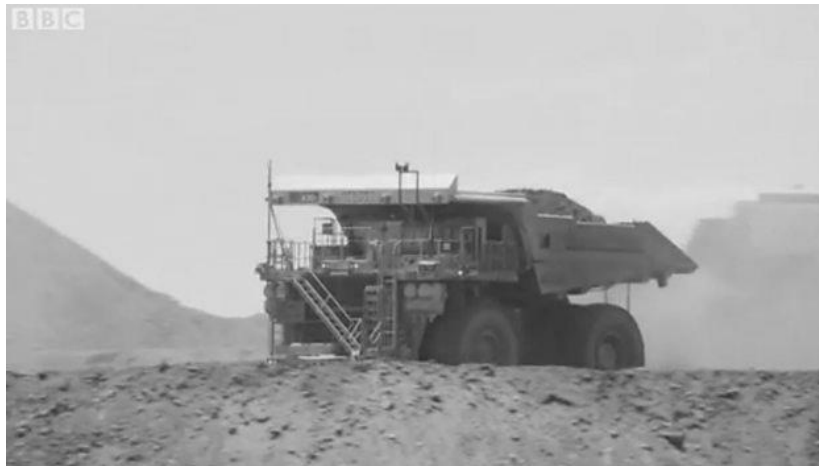
Image from an original BBC Click programme. Click is a BBC television programme covering news and recent developments in the world of consumer technology.